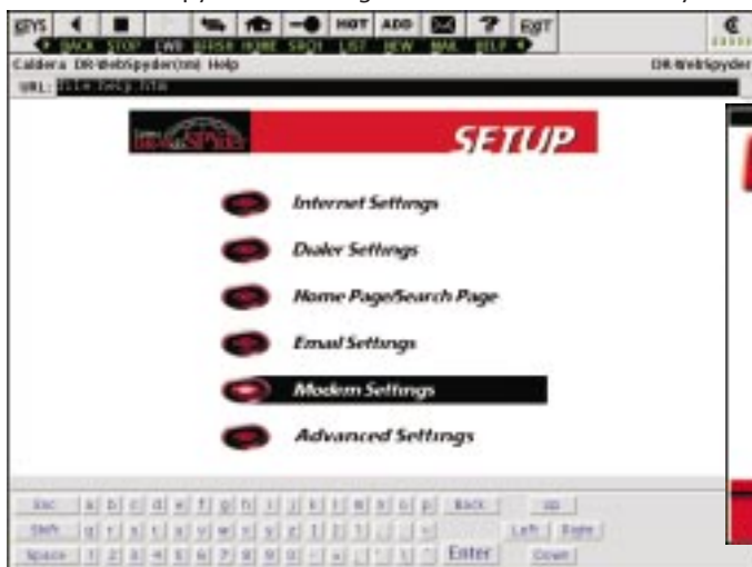
DR-WebSpyder with navigation bar and on-screen keyboard